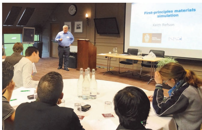
Lectures on Numerical Modelling at Old Thorns in 2016

Big Data and Numerical Modelling are hot topics at the moment. With STFC consulting on new doctoral training centres in Big Data science, the SEPnet community is meeting in Abingdon in September to co-ordinate a response. Integrating activity in Big Data will offer opportunities for enhanced training in the future.