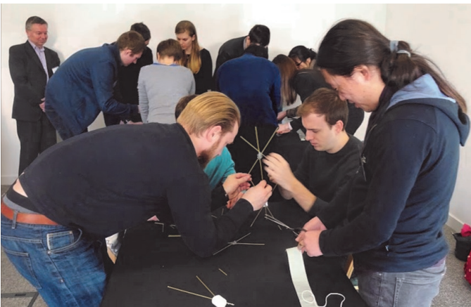
Teamwork: the marshmallow challenge at the 2016 GRADnet Winter School

For some of these events we will return to the Old Thorns Country Club which offers impressive facilities in the middle of our region. Others will be held at NPL.