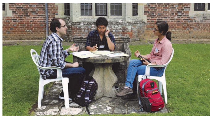
Developing a response to the Consultancy Challenge

Other activities included: intellectual property; public engagement and outreach in science; a tour of the Observatory Science Centre and, of course, a BBQ!