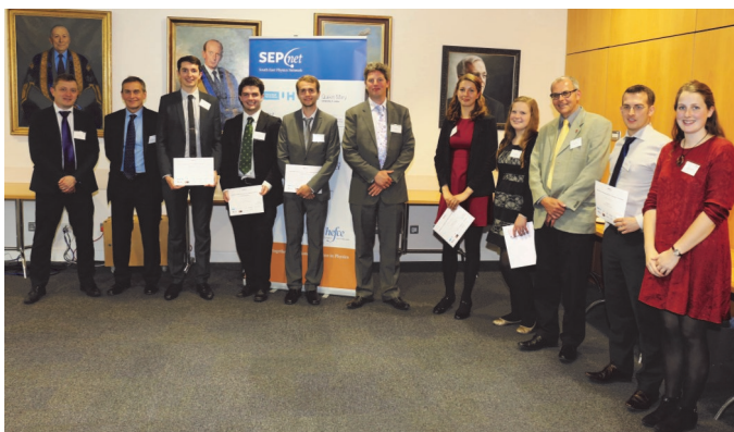
The Entrepreneurship in Action Challenge finalists from Southampton and Surrey.