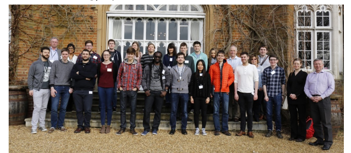
Winter 2016/17 at Windsor Great Park