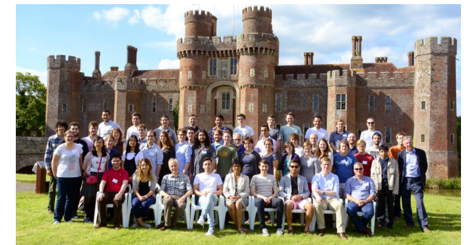
Summer 2015/16 at Herstmonceux Castle