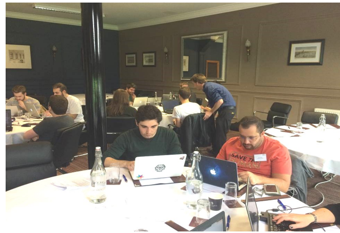
DISCnet students getting down to work.

The Old Thorns Golf and Country Estate, where the workshop took place, was as popular as ever.