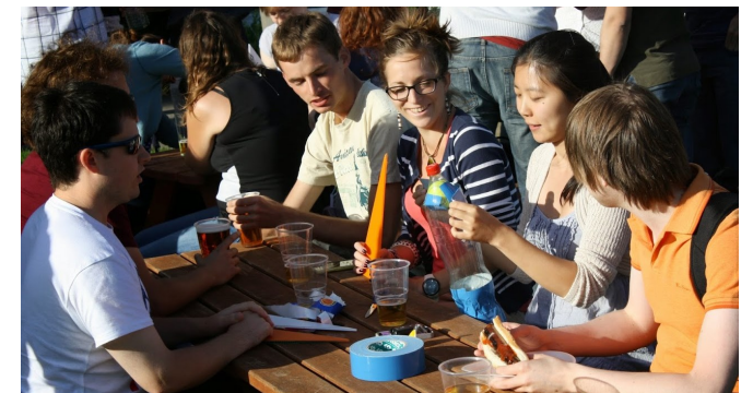
Summer 2013/14 at NPL